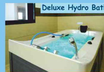
Deluxe Hydro Bath