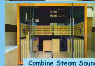
Combine Steam Sauna