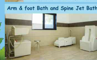
Arm & foot Bath and Spine Jet Bath